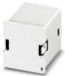
Replacement cover for slot 1 in base unit.