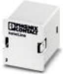
Replacement cover for slot 2 in base unit.

Covering hood - NLC-MOD-CAP-PXC - 2701292