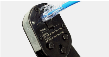
WIRE PATTERN ALIGNMENT Where you most need it, right under the crimp socket