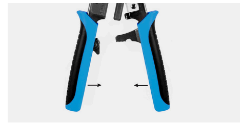
SYNCHRONIZED HANDLE for Smoother and Easier Crimping Cycle