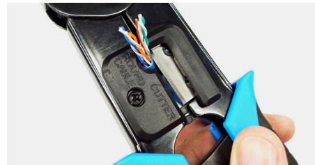
MULTI-FUNCTION: CUTS AND STRIPS CABLE (S45-C200 Exclusive Feature)