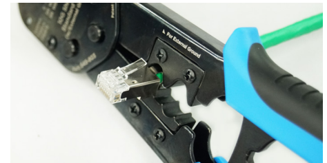
CRIMPS EXTERNAL GROUND ARM (S45-C250 Exclusive Feature)

For more information visit www.simply45.com