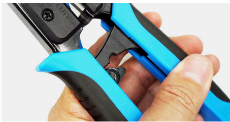
RATCHETED for Full Compression Cycle

Simply Better Quality, Simply Easier to Use, Simply More Affordable