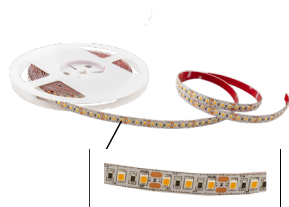
TSHL600-XX-12V-R16 16FT TAPELIGHT REEL