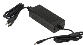
P72W12V 12V POWER SUPPLY