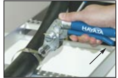
Grip Ratchet Handle and pull back toward Handle to tighten band.