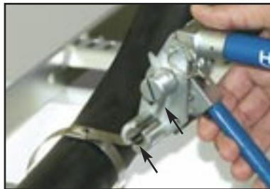
Position the CT-7 in loading position (ratchet handle forward) then place the band through Tool Nose and Winding Mandrel. Make sure there is plenty of band through the Mandrel.