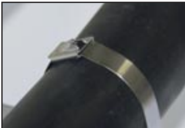
This band is installed. Discard leftover band material and move on to the next install!