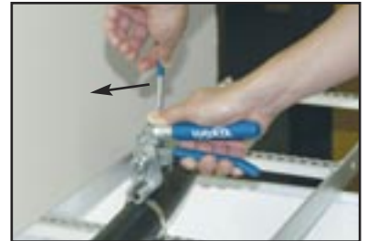
With a firm grip on the CT-7, grasp Cutter Handle with other hand.