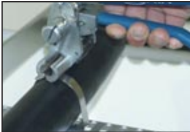
When desired level of band tightness is achieved, Tool Nose is flush with head.