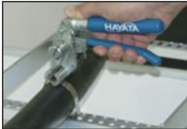
Repeat this action until band is at desired tightness.