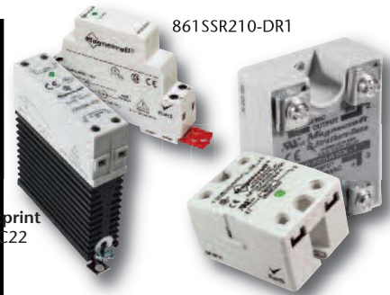
Smaller 22mm footprint SSRDIN230DIN-DC22