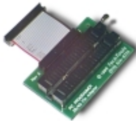
40Pin ZIF Programming Adapter #MP-ZIF40