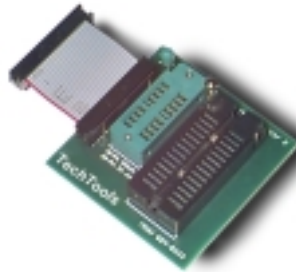
18Pin/28Pin ZIF Programming Adapter #MP-ZIF18/28