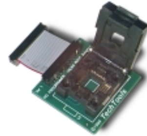
44Pin PLCC Programming Adapter #MP-PLCC44