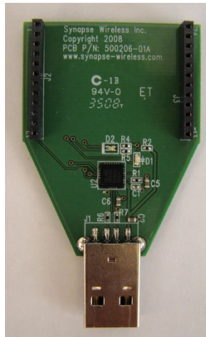
Figure 1 - Overhead view of SN 132 SNAPstick (no RF Engine installed)

The SN 132 SNAPstick is designed to be a compact and easy way to connect a PC to a SNAP wireless network.