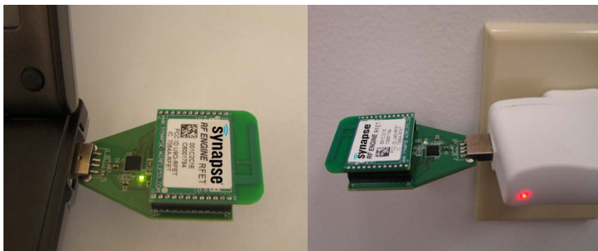
Figure 3 – A SNAPstick drawing power from a laptop PC and USB AC Adapter

The module does not require Synapse's Portal software or other software drivers to be installed in order to draw power from the PC's USB port.