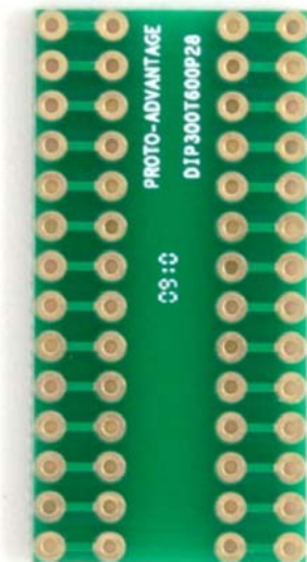
2D Top View (Pins Unassembled)