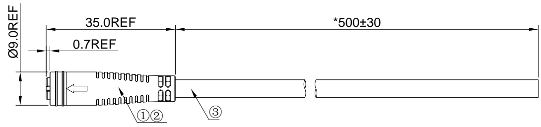
Connector P/N See CABLE 1