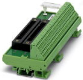
VARIOFACE interface module with spring-cage connection, for Yokogawa RTD module AAR145.

Please be informed that the data shown in this PDF Document is generated from our Online Catalog. Please find the complete data in the user's documentation. Our General Terms of Use for Downloads are valid ( http://phoenixcontact.com/download )