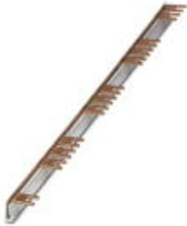
Wiring bridge for modules with connecting pitch 17.5 mm, 1-phase, 20 pitches with contact sequence 1-2-0-0-5

Please be informed that the data shown in this PDF Document is generated from our Online Catalog. Please find the complete data in the user's documentation. Our General Terms of Use for Downloads are valid ( http://phoenixcontact.com/download )