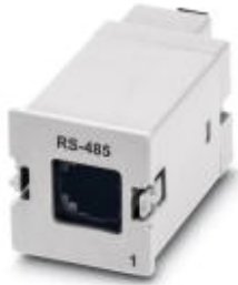
RS-485 connection for data transfer or software configuration

Please be informed that the data shown in this PDF Document is generated from our Online Catalog. Please find the complete data in the user's documentation. Our General Terms of Use for Downloads are valid ( http://download.phoenixcontact.com )